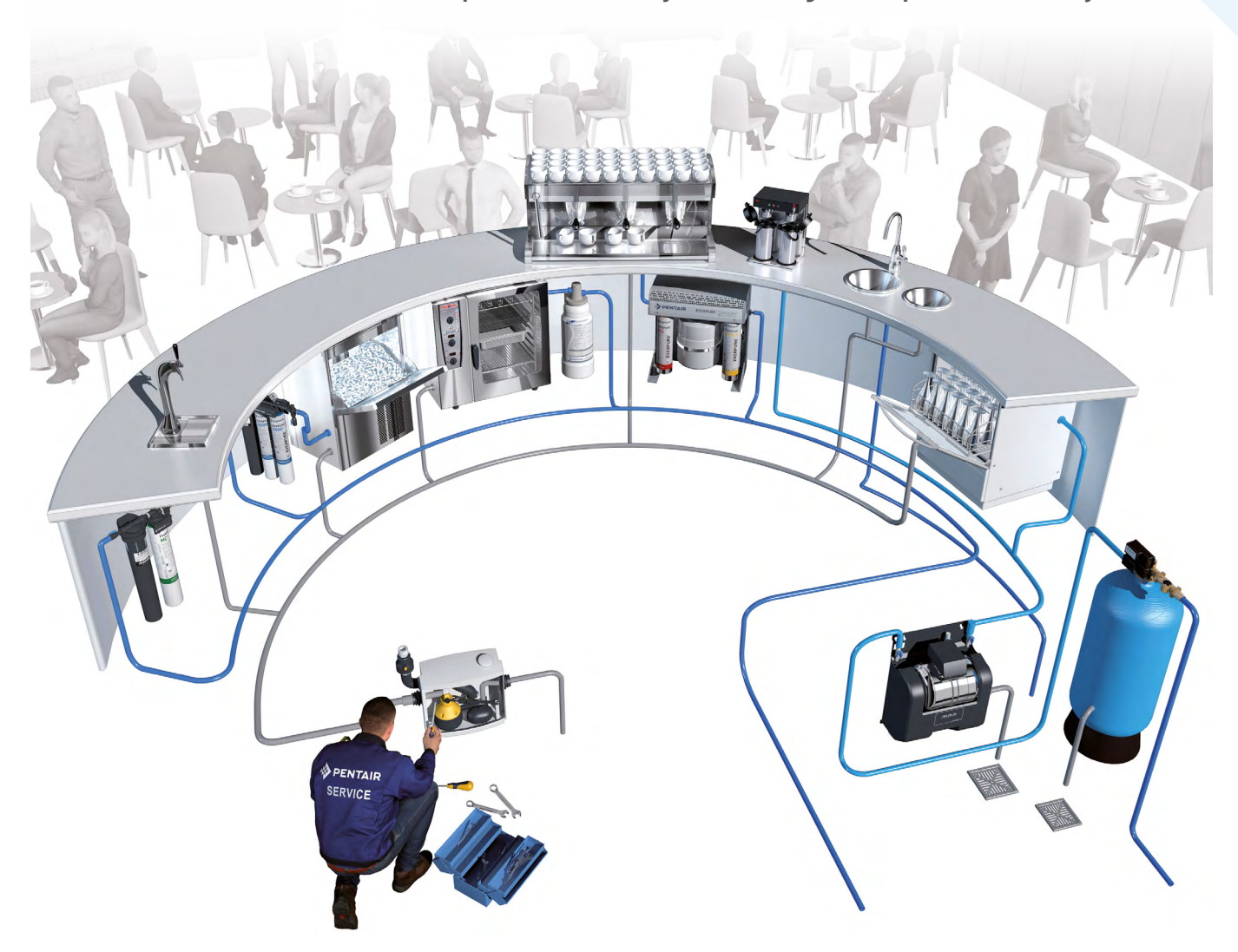
{\tt NOTE: This image is for illustrative purposes only and is not a true representation of the scale or the technical set-up of the products}

To discuss your foodservice environment and your TWM requirements contact your Pentair agent or representative today.