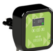
V132 SFE-EV Viridion by SIATA