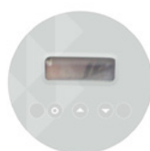
Electronic integrated display