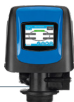
Valve 5800 XTR Fleck